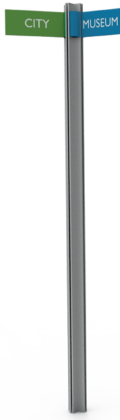
Tee Fingerpost Order Code: 9031-48-0000

A contemporary updateable fingerpost assembly to complement the Tee product range.